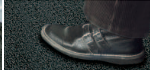
Simple and fast installation.