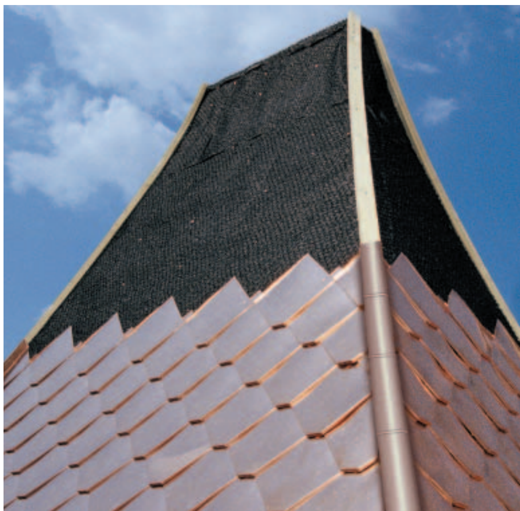
DELTA®-TRELA is the optimum air-gap sheet for high-quality metal roofs.

DELTA®-TRELA PLUS with integrated self-adhesive border provides a faster windtight installation.